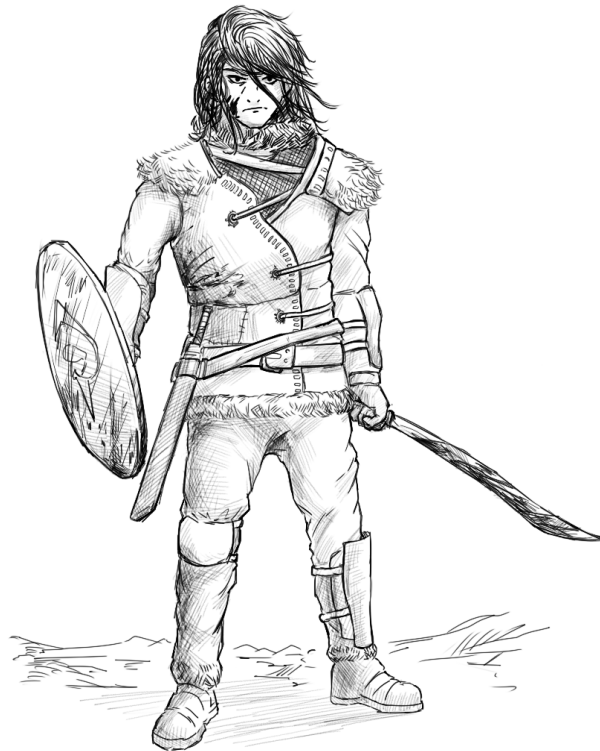
Image Description: A young man in leather armor holding a buckler and wielding a sabre.

There would be no stories of Jebran told around the cookfires of his home. And no one to mourn him save his brother. This battle would slip to memory and Jebran would be forgotten.