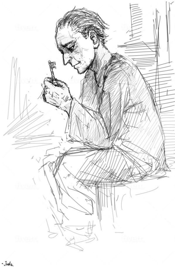
Image Description: An old man carefully holds and ponders an old skeleton key.

Ridiculous , he thought. He would fix this. He would right this wrong before she had a chance to pack away their life together and disappear with the children. But for now, this was a mess to be swept into the corner and dealt with later.