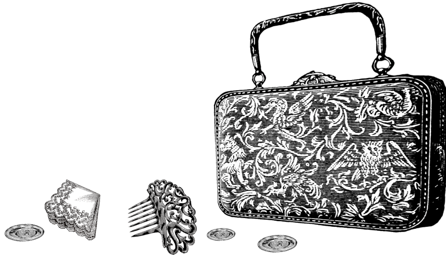
Image Description: An old-fashioned embroidered travel bag sitting next to some discarded items; a hair comb, a handkerchief, and some coins.

‘Looks like she was going somewhere,’ the guard clutched the parchment in her hand, ‘and she never made it.’