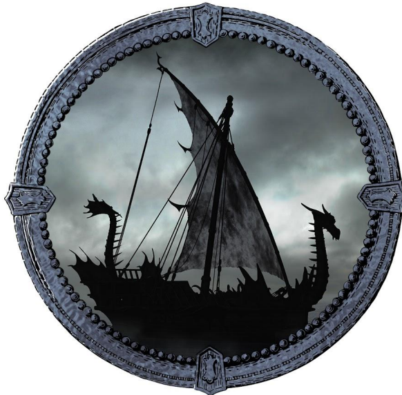
Image Description: A sharp and spiky viking-esque ship with a single sail and an ornate dragon's head on the prow.

The other ships in the war fleet sailed on every side of them, with their black dragon figureheads, and their prows cutting through the grey waters.