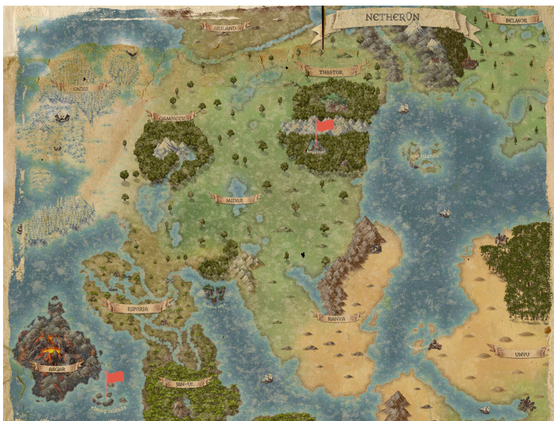
Image Description: A map of a fantasy world with many different regions; forests, islands, deserts, fields, and mountains. Two flags mark out the locations this volume's stories take place in. Keystone is a city surrounded by forest close to both mountains and the coastline in the middle of the map and the black mountain islands are to the very far south west, near a big volcano.